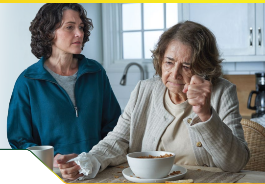
Hypothetical patient and caregiver